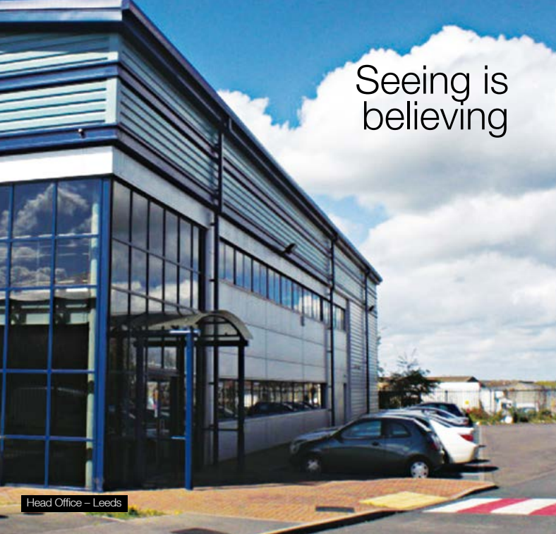
Head Office – Leeds